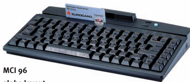
MCI 96 alpha layout