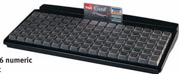
MCI 96 numeric layout